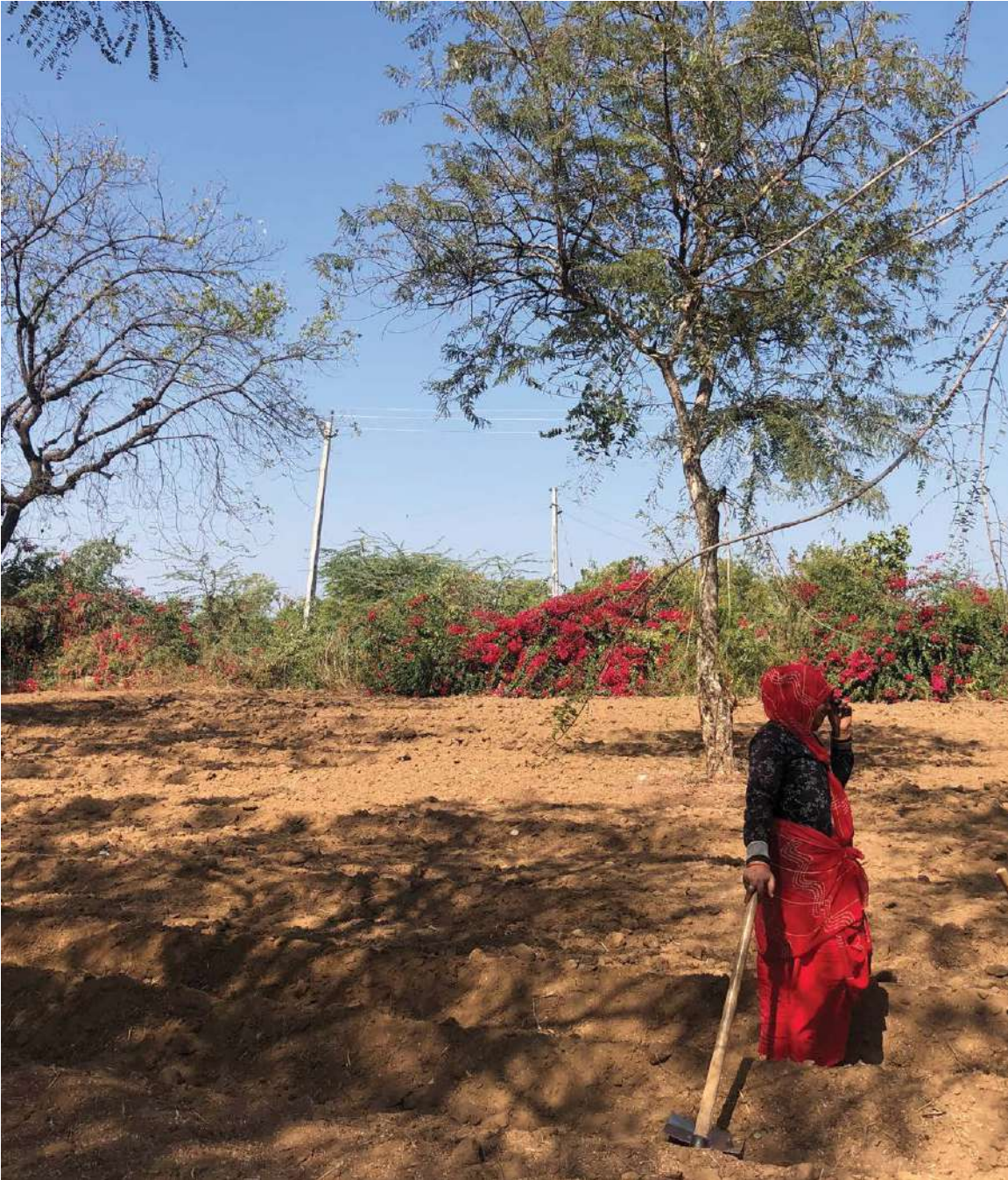
SEWA member working on the farm