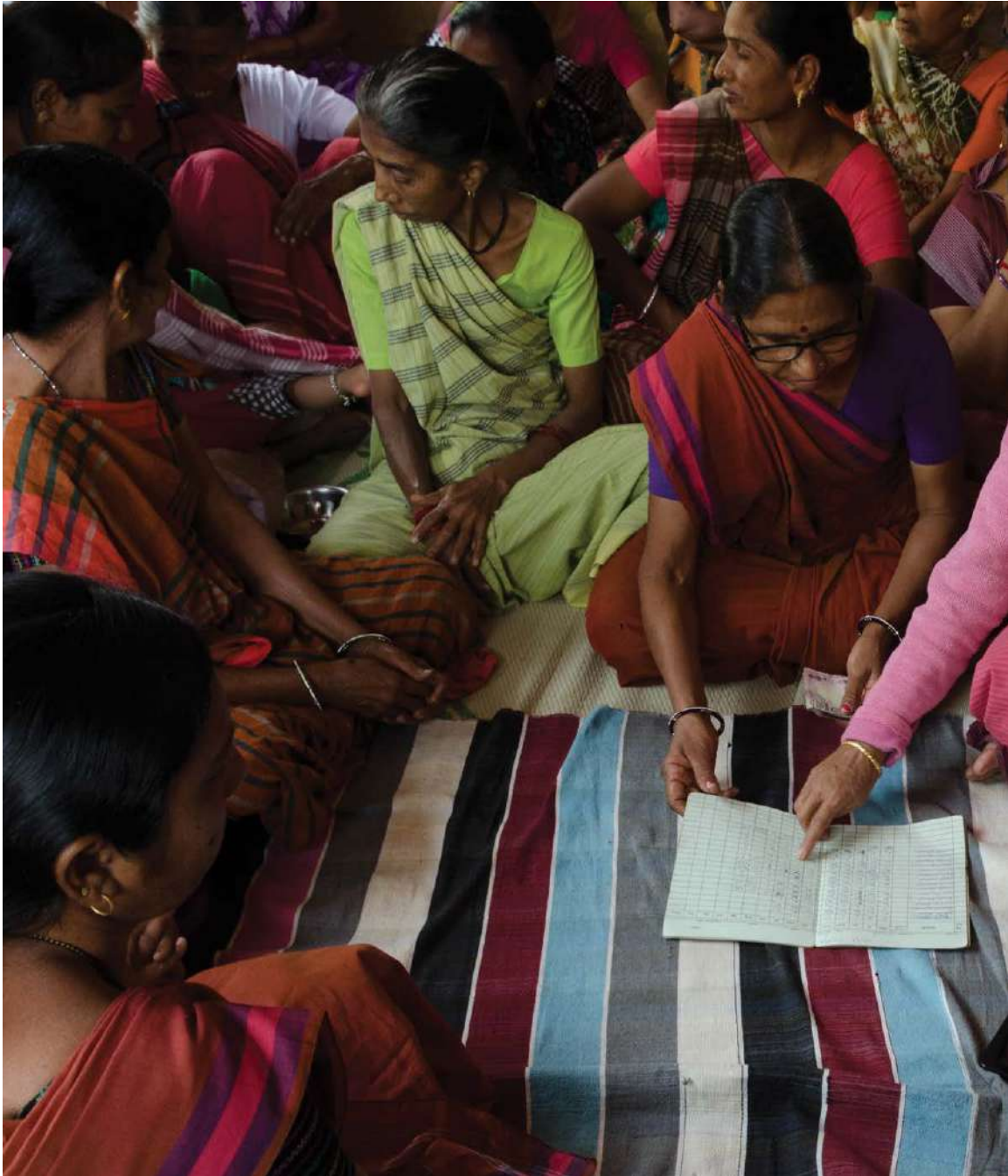
SEWA members in a savings group meeting