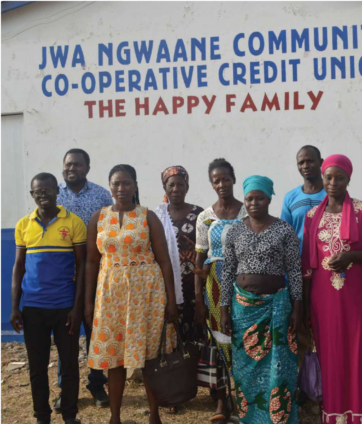
Members of the Jwa Ngwaane Community Cooperative Credit Union standing in front of the offices