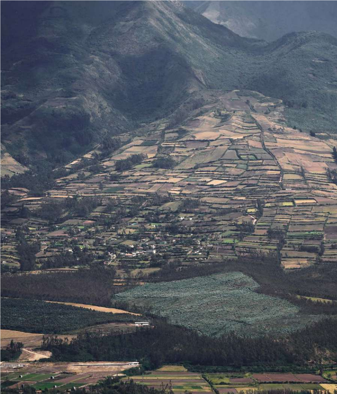
Andean Chakra, an ancestral agricultural system of the Kichwa Indigenous Peoples in Ecuador