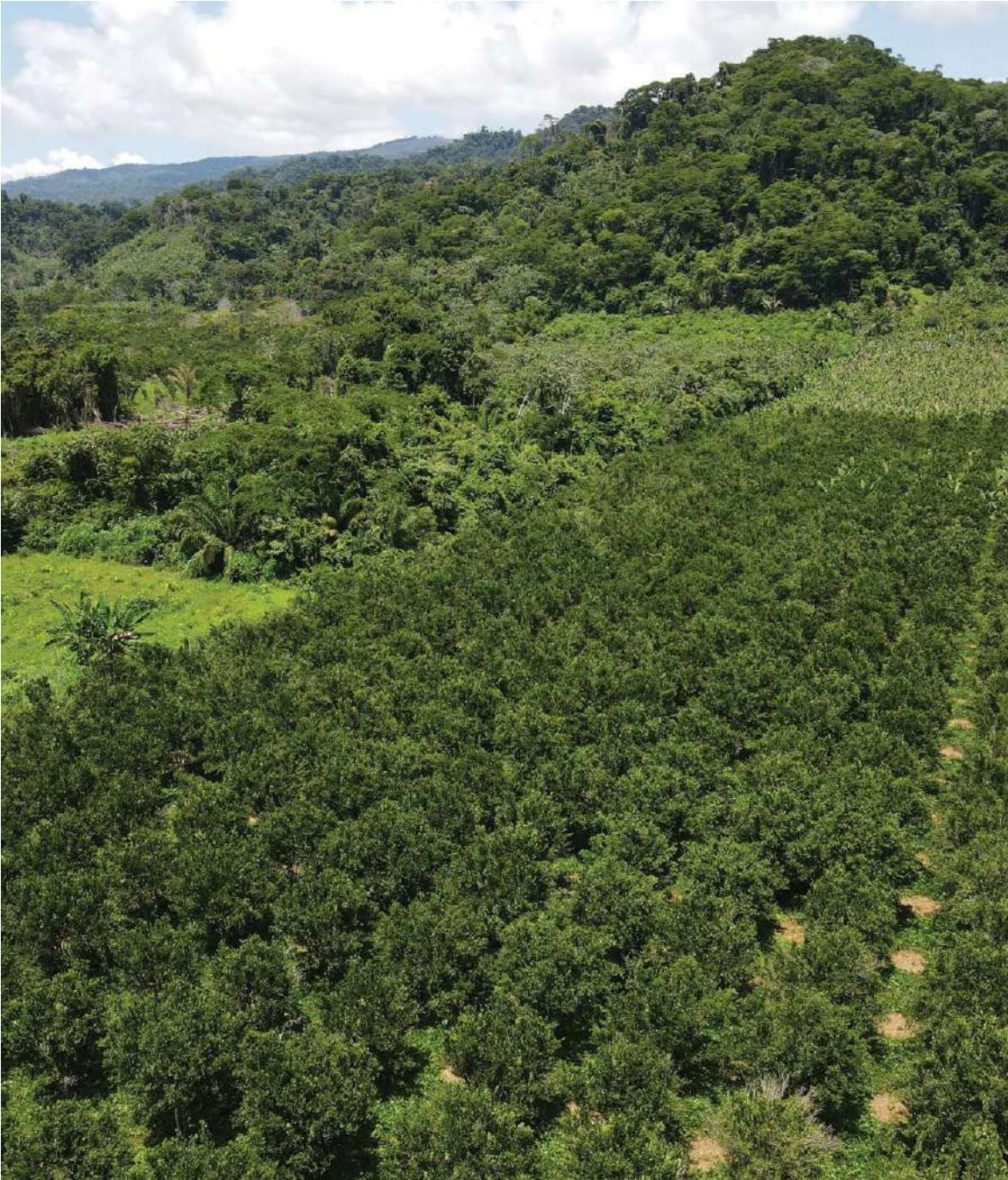
Diverse agroforestry system of El Ceibo