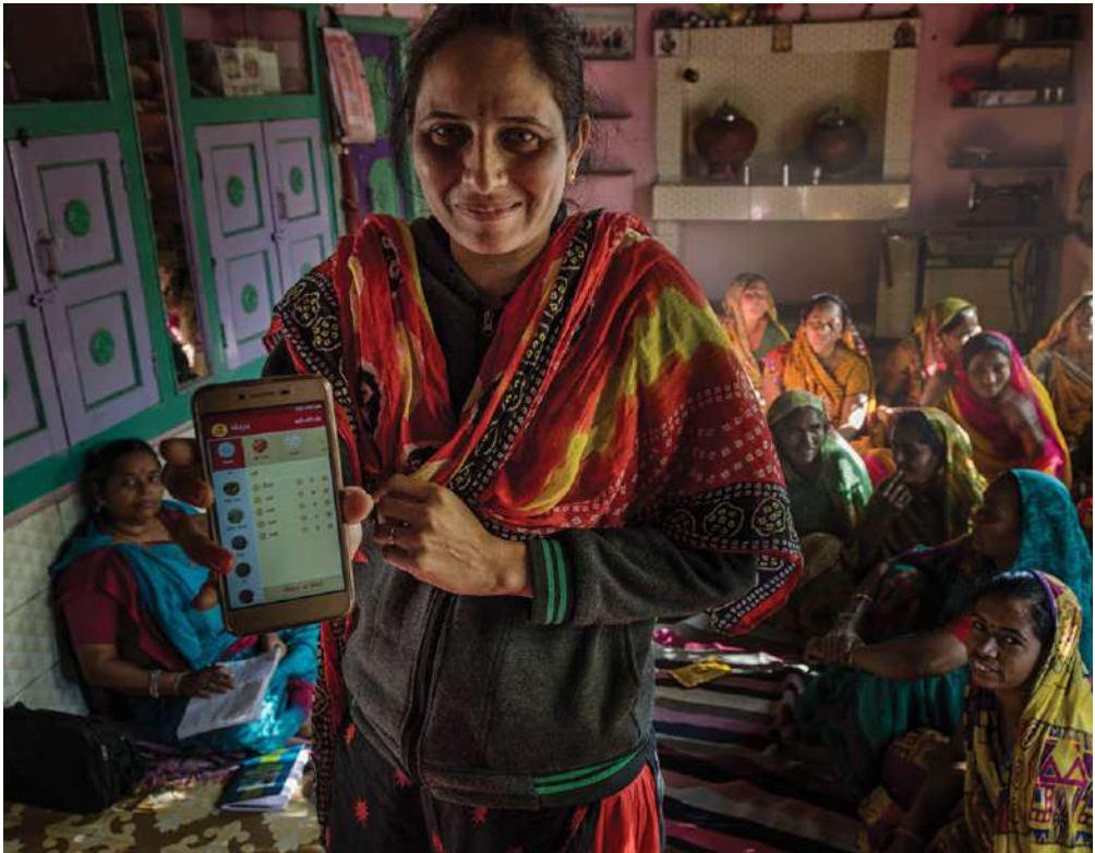
SEWA member showing the RUDI mobile business app

At the village level, women started savings groups organised by trade, such as farming. These groups enabled them to save collectively, take out small loans when needed, and served as a space to share experiences, learn new skills and generally benefit from peer support. SEWA started in these districts with one savings group of 11 people and there are now over 1,300 groups, which range from 10 to 15 members. New members contributed by paying a one-time membership fee of US$1.20 and then US$0.20 annually, which provided the initial capital for the association to formally establish itself.