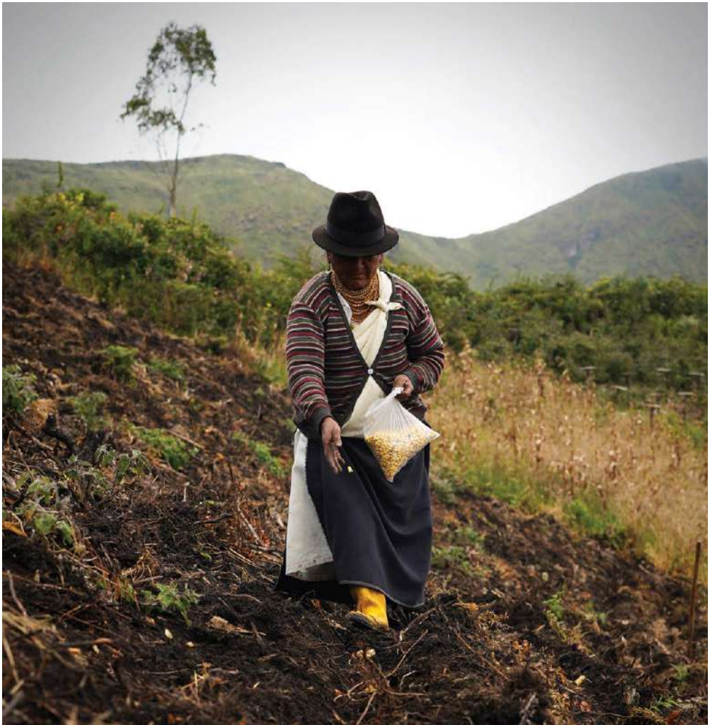
UNORCAC member working on the chakra

From these experiences, UNORCAC decided to establish a SACCO. To come up with the initial capital, UNORCAC encouraged its members to buy shares, known as certificates of contribution in Ecuador. The founding members were 20 individual leaders of group members of UNORCAC, who purchased certificates at US$15 per member. UNORCAC itself as a legal entity also contributed a total of US$30,000. Lastly, UCODEP (Unit of Cooperation and Development of People, now Oxfam Italy) contributed US$5,000 in certificates of contribution, but although this made it a founding partner it did not remain as a member and the amount was treated as a donation without any attached conditions, thereby not interfering with the management of the cooperative, which remained democratically governed by its members.