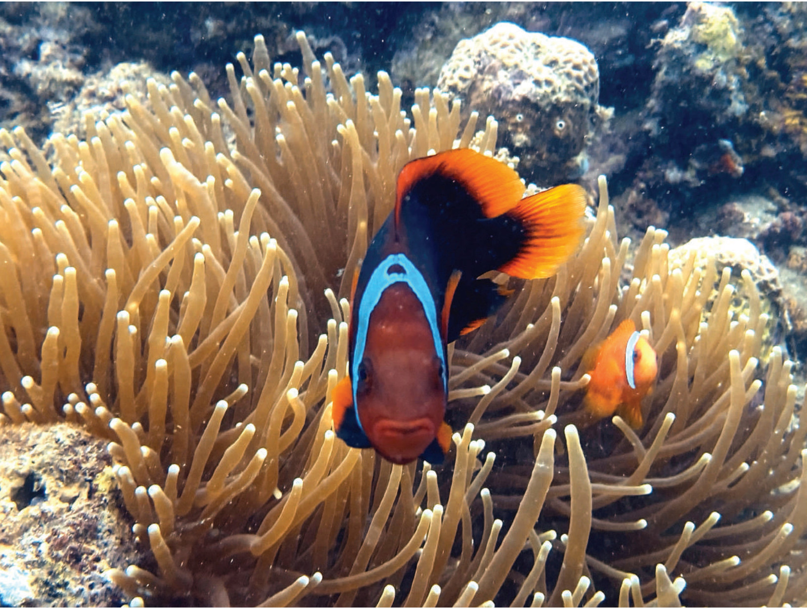
Marine life in Batangas. Healthy coral is critical for maintaining ocean biodiversity, Philippines.