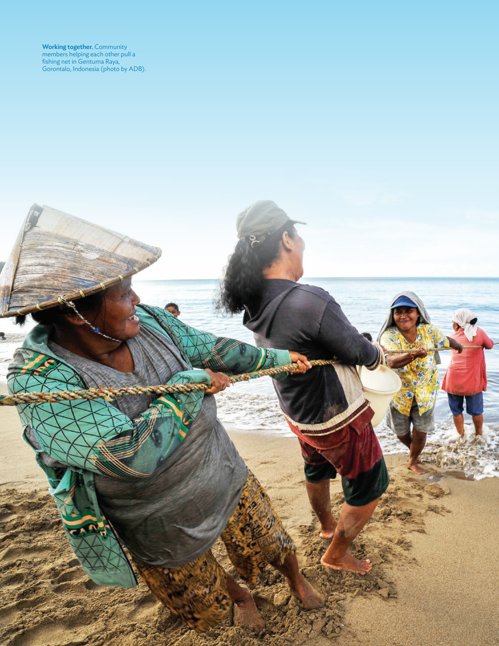
Working together. Community members helping each other pull a fishing net in Gentuma Raya, Gorontalo, Indonesia.